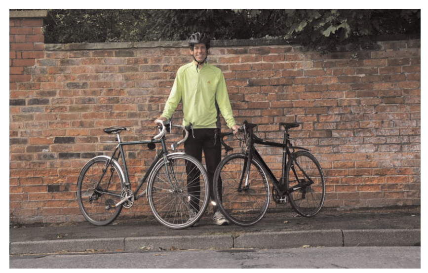
Fig 1 | The author and the two bicycles used in the study, with the steel frame bike on the left and the carbon frame bike on the right

The top speed achieved was 36 mph (58 kph) on both bicycles. The slowest journey was on the carbon bike in heavy snow (2:03:20 hours:minutes:seconds). The fastest journey was on the steel bike (1:37:40) and was as a direct result of chasing one of my fitter cycling colleagues to work (fig 3). The average journey time on