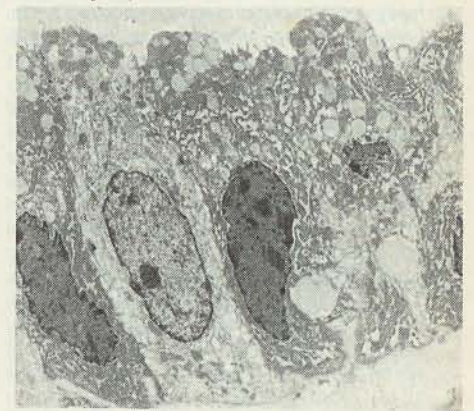
FIGURE 3: Fourteen days after ingestion of PC. A. Haematoxylin-eosin-stained paraffin-embedded section. PMNs are rare, epithelial cells contain mucus, but not yet in normal quantities (original magnification \times 250). B. Mucus content (pink-staining) of epithelial cells is now about 50% of normal (PAS stain; original magnification \times 250). C. Electron micrographs show that many epithelial cells are still abnormal. Microvilli are lacking, the cell surfaces are smooth and bulging, and mucin granules are still depleted (compare with Figure 1B) (original magnification \times 4800).

We have shown that ingested PC organisms are able to colonize the completely normal gastric mucosa. This colonization is associated with acute inflammatory changes; PMN infiltration and exudation from the mucosa; mucus depletion; and reversible epithelial cell damage. These changes may now be referred to as being characteristic of "acute pyloric campylobacter gastritis". In our subject, the host defences eradicated the