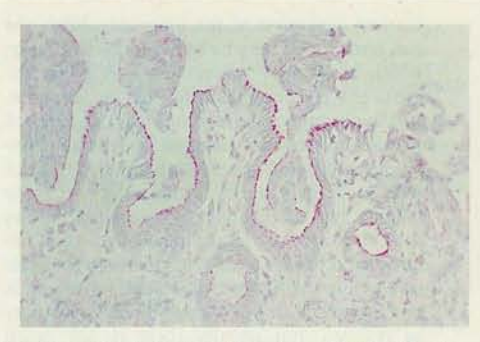
FIGURE 2: Ten days after ingestion of PC. A. Haematoxylin-eosin-stained section shows PMN infiltration of the lamina propria and glands (original magnification × 250). B. PAS-stained section shows that the epithelial cells contain very little pink-staining intracellular mucus (original magnification × 250). C. Numerous PC organisms demonstrated by Warthin-Starry's silver staining (original magnification × 900). D. Electron micrograph of the reprocessed paraffin material demonstrates PC organisms adhering to an epithelial cell with altered smooth-surface membrane (original magnification × 16 500).

second week. His faeces softened slightly, but did not progress to diarrhoea. The subject was irritable, and appeared ill during the second week of the experiment; several colleagues observed that he developed "putrid" breath.