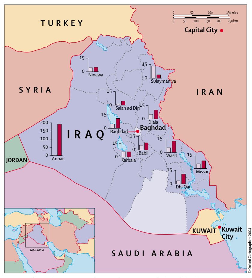
Figure 1: Crude mortality per 1000 people per year, by Governorate, before and after the invasion Bar graphs represent number of deaths per 1000 person-years. Governorate rates are on a scale of 15 deaths per 1000 person-years, except for Anbar governorate, where deaths were more than ten times higher.

We tabulated data and calculated the number of births, deaths, and person-months associated with every cluster. For every period of analysis, crude mortality, expressed as deaths per 1000 people per year, was defined as: (number of deaths recorded/number of person-months lived in the interviewed households) \times 12 \times 1000 . We estimated the infant mortality rate as the ratio of infant deaths to livebirths in each study period