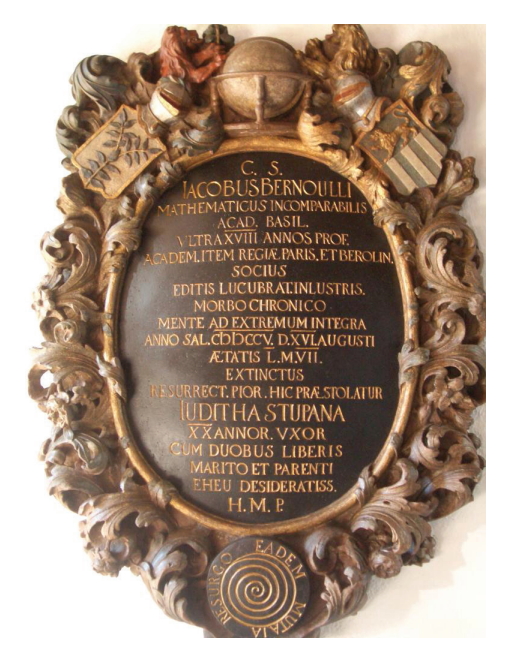
Jakob Bernoulli's tombstone, Basel cathedral.

"To illustrate this by an example, I suppose that without your knowledge there are concealed in an urn 3000 white pebbles and 2000 black pebbles, and in trying to determine the numbers of these pebbles you take out one pebble after another (each time replacing the pebble you have drawn before choosing the next, in order not to decrease the number of pebbles in the urn), and that you observe how often a white and how often a black pebble is withdrawn. The question is, can you do this so often that it becomes ten times, one hundred times, one thousand times, etc., more probable (that is, it be morally certain) that the numbers of whites and blacks chosen are in the same 3 : 2 ratio as the pebbles in the urn, rather than in any other different ratio?"