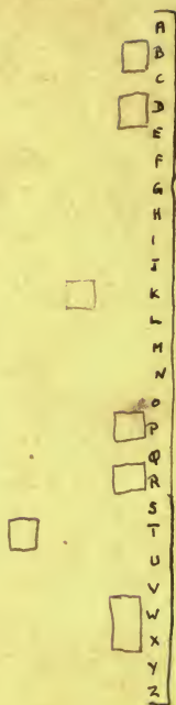
Fig 4. Apparatus for scoring - Virginia. Point marks arranged & 1st column of Fig 1.