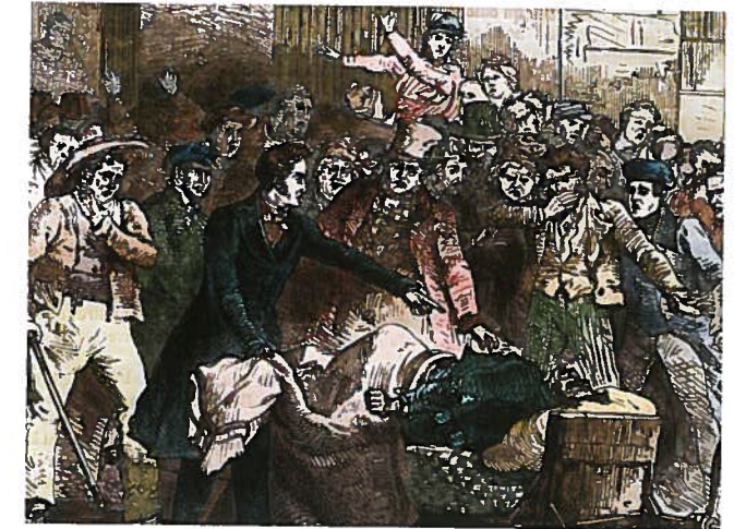
A depiction of the 1832 cholera epidemic in Paris.