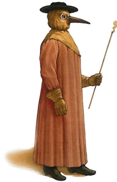
A 17th-century physician wearing a traditional plague-preventive costume.