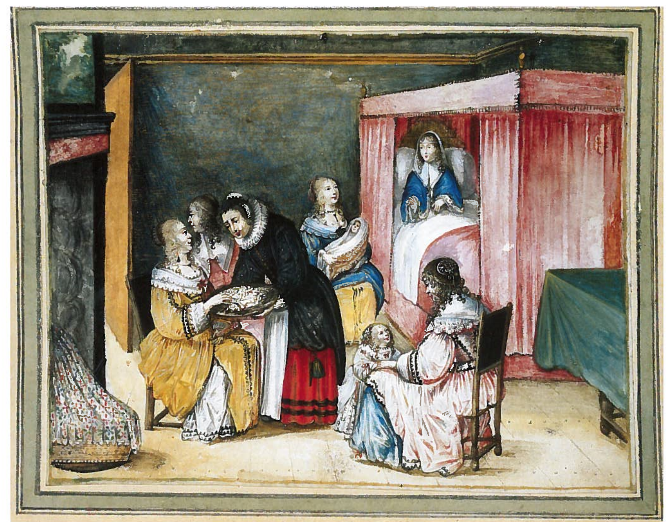
In a 17th-century Dutch birth room a maid hands round sweets to ‘gossips’ – females who attend the birth.

Giving birth had always been an ordeal, a risky time for both mother and child. With no anaesthetics apart from opiates and alcohol, no antibiotics and little in