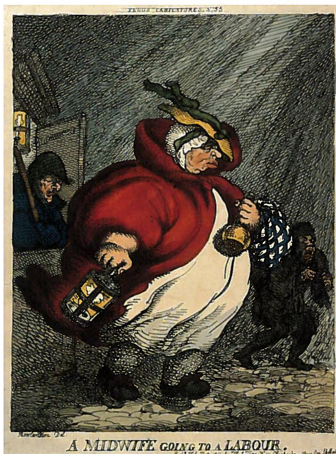
An early 19th-century cartoon depicting a midwife on her way to a labour in the early hours of the morning.